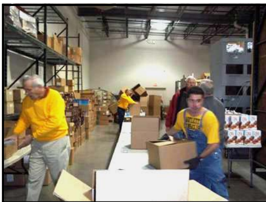
Pictured above are Bartlett Lions packing food boxes to make the holidays a bit better for 400 families in the area. Many Lions Clubs throughout the District did similar projects during the holidays.

This is just one example of "We Serve." (See many more examples on page 9.)