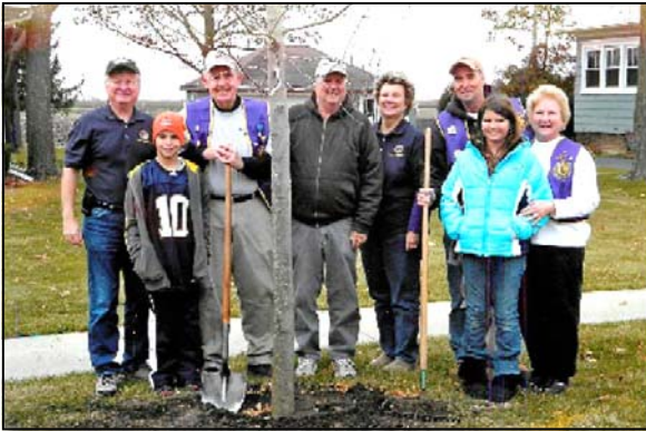
Shabbona Lions' Green Team" planted three beautiful Autumn Blaze maple trees in the Village. They will be easy to spot next fall -- just look for the nice-looking trees -- and thank the Shabbona Lions!