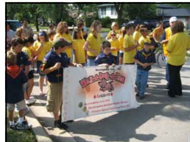
Bloomington Leos & Lions and some Erickson School