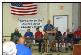
A Football Coaches Night, hosted by the Aurora Noon Lions Club, at Luigi's gave a preview of the coming football season for fans and supporters.