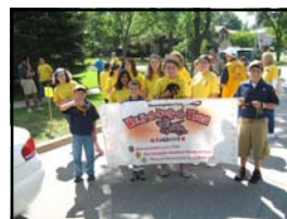
Cub Scouts prepare to march in the Septemberfest Parade. The group advertised the Walk-A-Dog-A-Thon they will be sponsoring in late Sept.