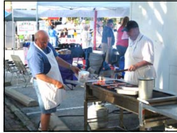
Bloomington Lions run a tight ship at the club's Concession Stand at Septemberfest. . . And gather lots of tips!!