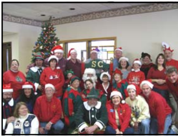
Roselle Lions Kids' Christmas with Santa Party. Anyone recognize Santa (besides Roselle Lions)?