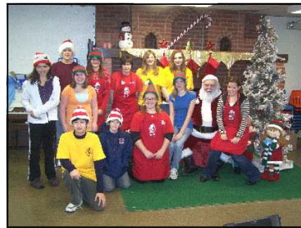
Then, all the Leos gathered around Santa for a picture.