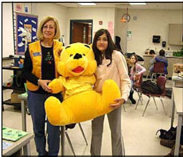
Bloomington Westfield Leos made cards for area nursing homes. All were voted on and the winner took home this large teddy bear wearing a Leo shirt!