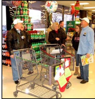
"The race is on!" Teams of Bloomingdale Lions get ready to shop for the club's Christmas Baskets program. The team that comes closest to $200 wins the betting pot. See story on p. 4 for more.