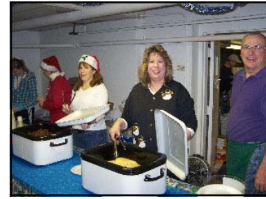
North Aurora Leos helped North Aurora Lions with the Breakfast with Santa.