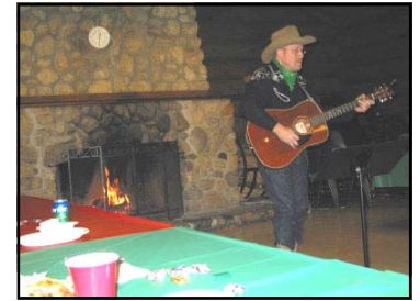
Lombard Lions Club met at the Lombard Log Cabin for the club's Christmas Party. Lions ate pizza and were entertained with country Christmas songs.