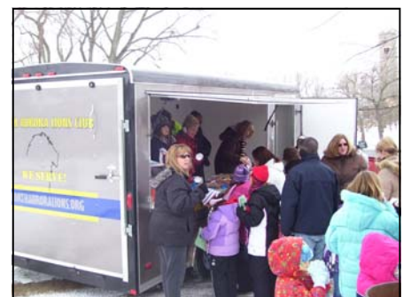
North Aurora Leos & Lions served hot chocolate at the Village Christmas Tree decorating ceremony.