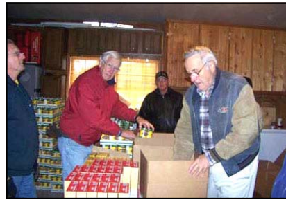
Bartlett Lions packed 250 boxes with fixings for a Christmas meal for less fortunate families in town.