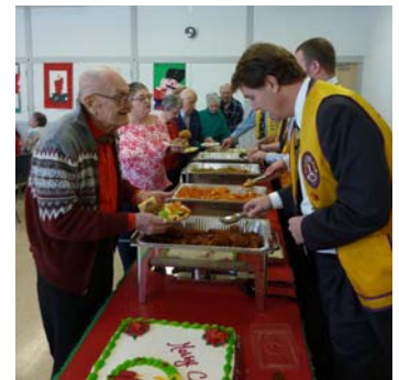
Lombard Lions provide an annual Christmas Party for the Deicke Home/Senior Men's Club. Gifts and food are provided as well as Santa handing out stockings to Deicke Home residents.