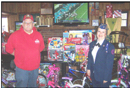
Crystal Lake Lions Club was just one of the clubs that contributed to Toys for Tots in their area.

Crystal Lake Lions, The Cottage and the Marine Corps League provided hundreds of toys for needy children in the McHenry County area this past holiday season.