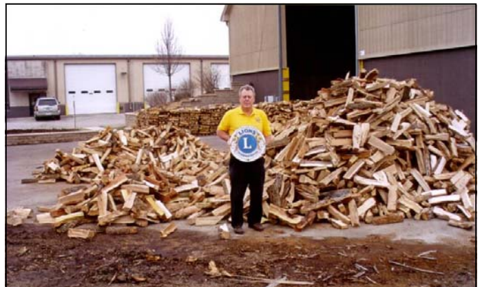
West Chicago Lions are starting to get firewood ready for the club's Fall 2011 selling season. The 2010 sale made enough to give $5,000 to three food pantries in West Chicago.