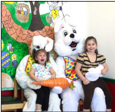
As much as we like to think the Easter Bunny makes everyone happy, here's proof that it doesn't always! He/She was part of the Aurora Noon Lions Breakfast with the Bunny.