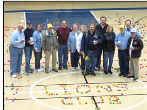
Bloomingdale Lions scattered 3,000 eggs over the gym floor