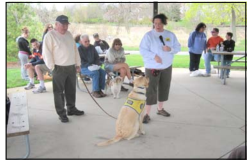
Canines for Independence were definitely one of the "main acts" at the Bloomingdale Lions' annual Walk=A-Dog-A-Thon. Proceeds earned from the Walk were donated to Canines for Independence.